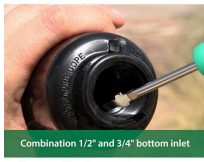
Combination 1/2" and 3/4" bottom inlet