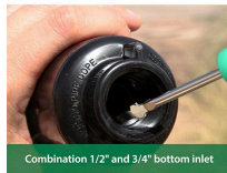
Combination 1/2" and 3/4" bottom inlet