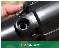
1/2" side inlet